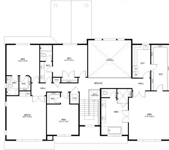
Upper Floor Plan

www.AmericanClassicHomes.com Renderings and floor plans are artist's concept and for illustrative purposes only. Standard features may vary by community. Floor plans, dimensions, garages and patios may not be available in all communities upon all home sites. In a continuing effort provide a quality product, we reserve the right to change floor plans, elevations, specifications and prices without notice.